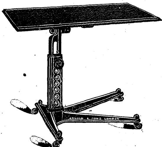
Flat for Use as a Table.

A really reliable natural beef-tea is a boon in every household, for it is an excellent stand-by when soups and gravies are needed in a hurry, while it is not too much to say that in a case of illness the purity, or the reverse, of the preparation used may turn the balance of life and death, so that the greatest care is necessary in its selection. It is satisfactory to know that CARNOS, manufactured by Carnos, Limited, Wragby Street Works, Great Grimsby, and of which the London office is at 8, Warwick Court, Holborn, W.C., is